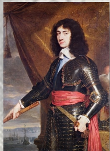
King Charles II