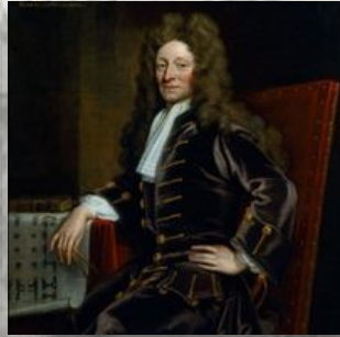
Sir Christopher Wren