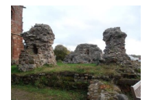
Ruyton XI Towns Castle